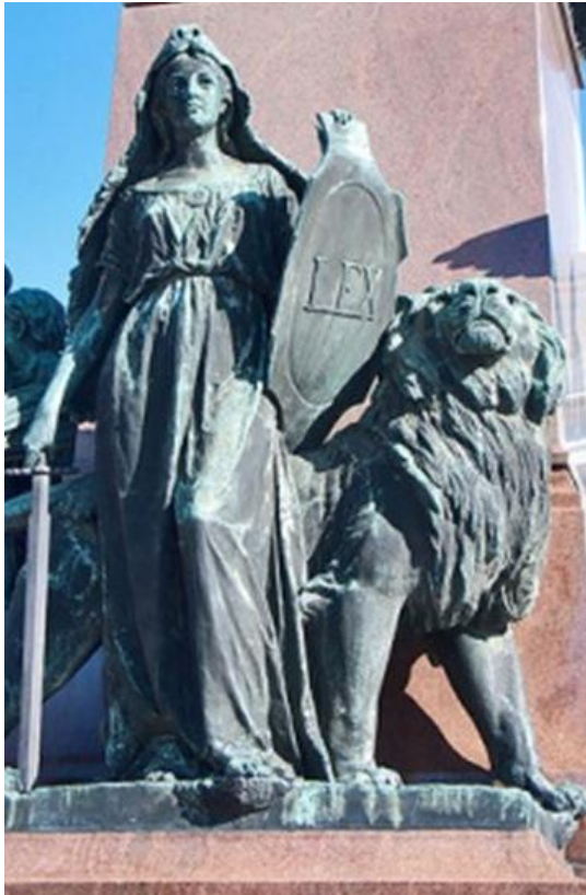
The figure representative Law (Lex), Senate Square, Helsinki

The right to Information is ensured in the present Finnish Constitution Section 12 (2)