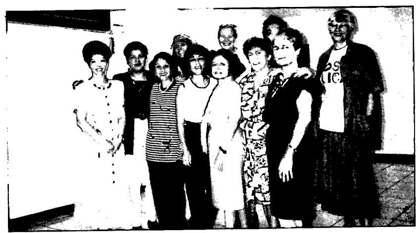
Standing Committee Meeting, IFLA/LAC, Managua/Nic., 9-10 March 1995.

Please see PUBLICACIONES RECIBIDAS in the Spanish Text.