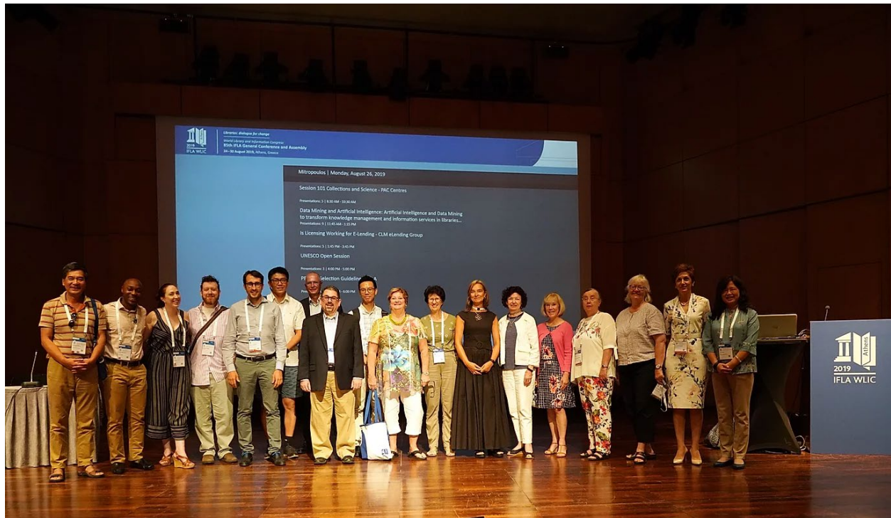
IFLA Knowledge Management Standing Committee 2019-2021

Serving Knowledge Management Professionals Worldwide