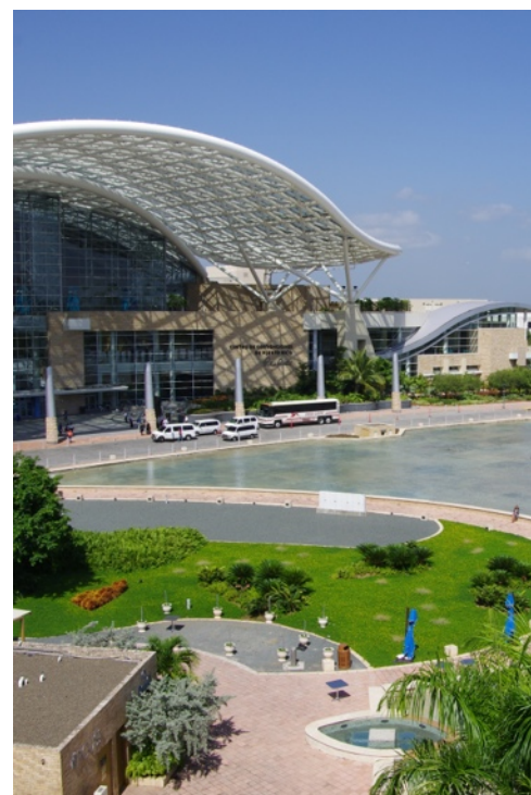
Puerto Rico Conference Center

Obviously, IFLA WLIC 2011 was the right time to exchange experiences about strategies and lessons learned.