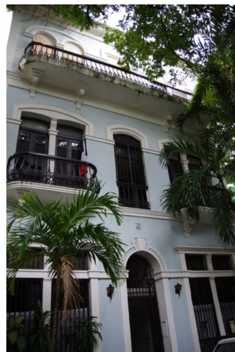
Puerto Rico, Old Quarter