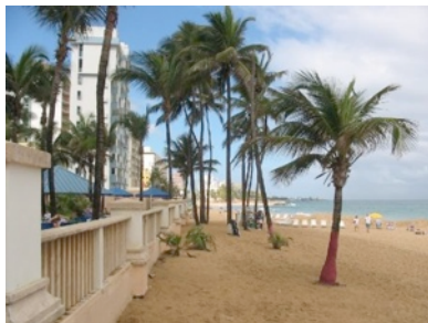
San Juan City Beach.

Going to a Caribbean island makes you think of white, sandy beaches, coconut palms, sun and lazy afternoons. Puerto Rico has all this and more! But 2500 librarians and other information specialists had an even better reason to go to Puerto Rico. The World Library and Information Congress 2011 offered a great variety of sessions, meetings and networking opportunities.