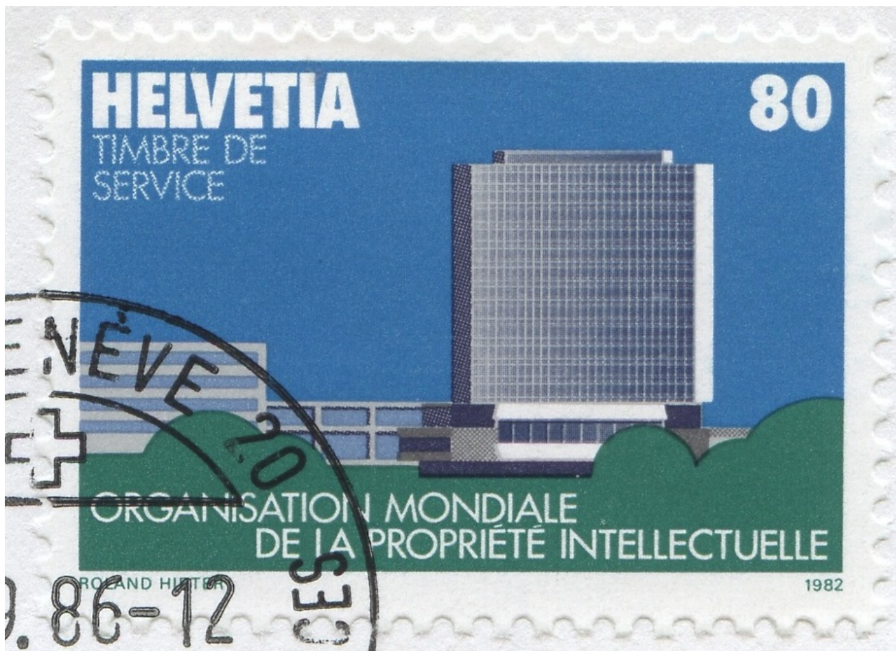
80 cent WIPO service stamp featuring the WIPO Headquarters in Geneva.