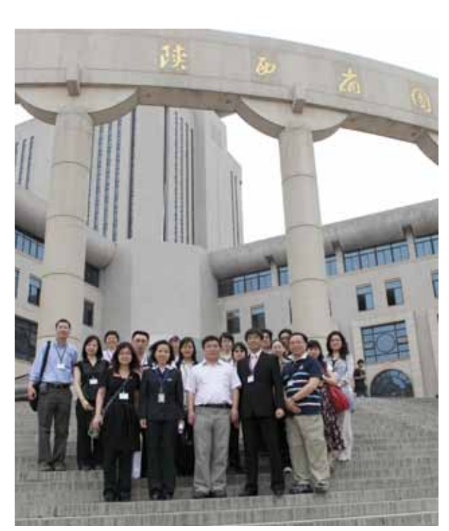
HKLA members in front of Shaanxi Library in the HKLA Study Trip to Xi'an in 2010. More details are available at http://hkla.org/ newsletter/sup2010.pdf

To know more about the Association, please visit its bilingual website at http://www.hkla.org/