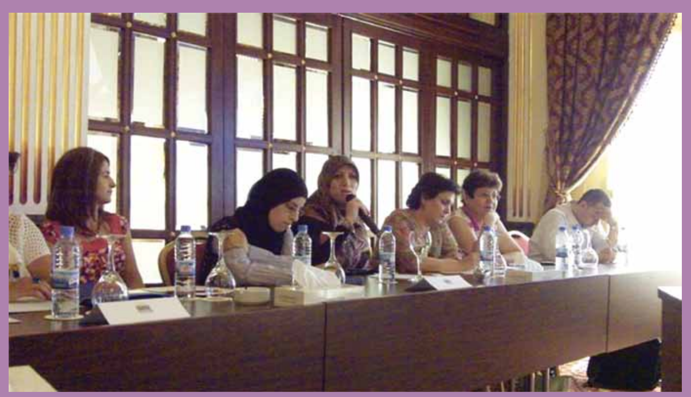
One of the meetings in Beirut, Lebanon