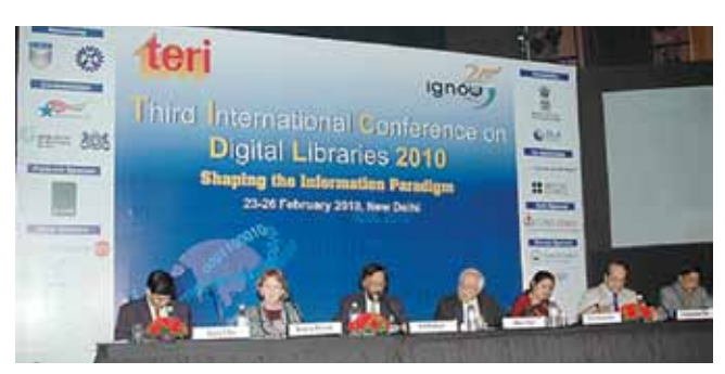
Inauguration Session of ICDL 2010

The Third International Conference on Digital Libraries (ICDL 2010), jointly hosted by The Energy and Resource Institute (TERI) and Indira Gandhi National Open University (IGNOU), was inaugurated by Kapil Sibal, Minister for Human Resource Development of Government of India and Chief Guest of the Conference at India Habitat Centre, New Delhi on February 23, 2010.