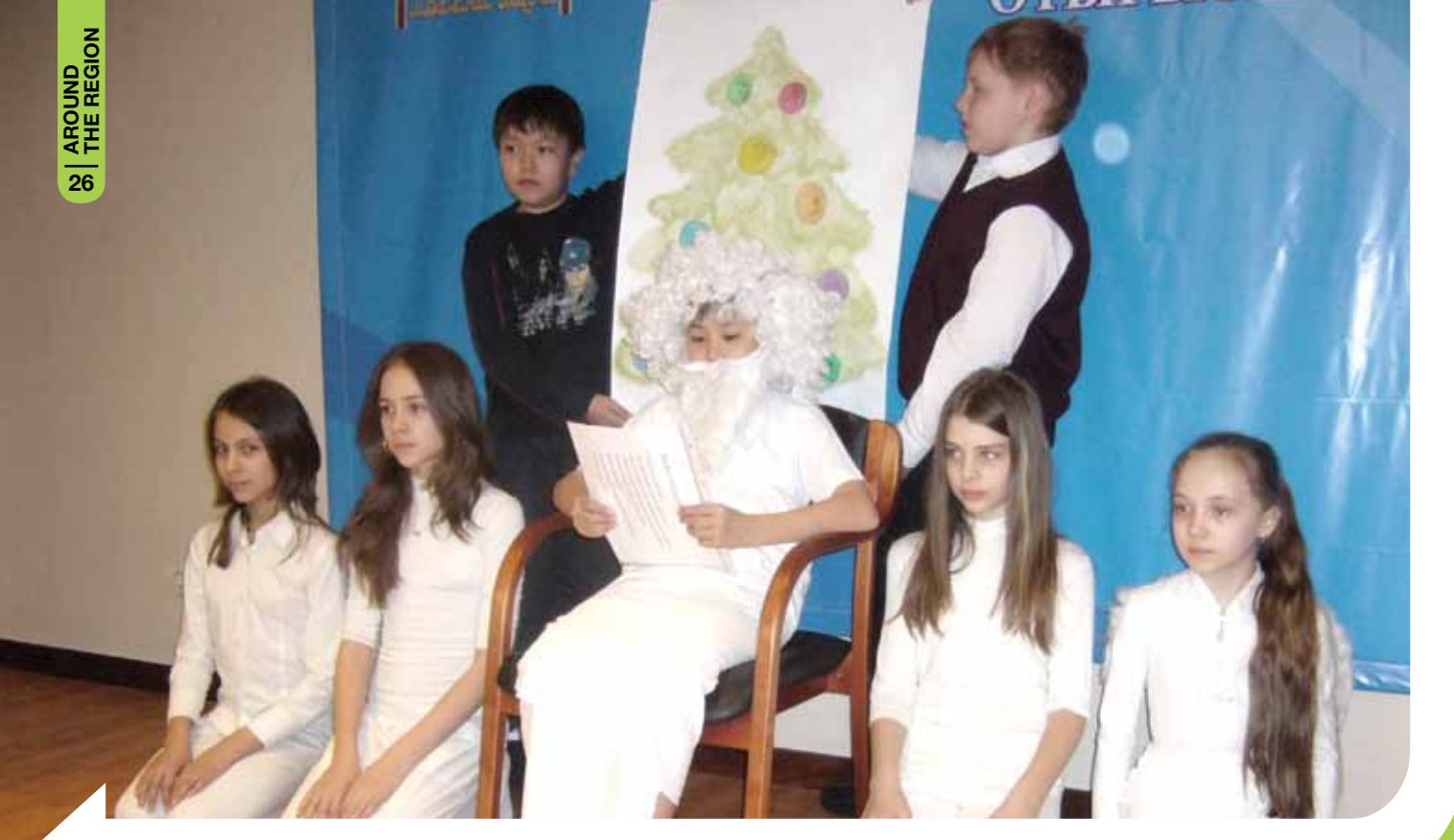
Theatre staging by school students