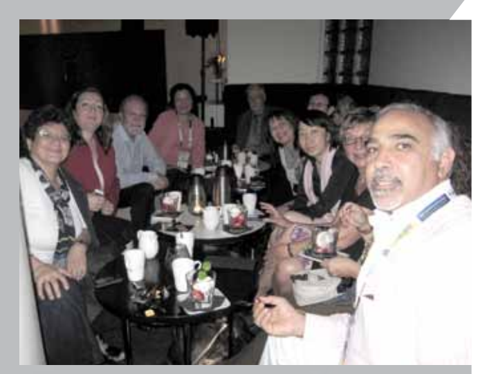
RSCAO get-together dinner on August 11

RSCAO members also had the opportunity to catch up over a get-together dinner organised by Regional Office after the first Standing Committee meeting on August 11. We are also very grateful to Emerald, which has always been very generous to the Asia and Oceania Section, for hosting a dinner for Division V members at the IFLA Conference on August 13, 2011.