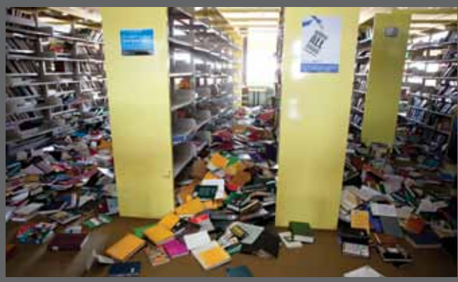
Inside Canterbury University Library

Photos of Canterbury Medical Library: http://www.library.otago.ac.nz/tools/what.html#sept