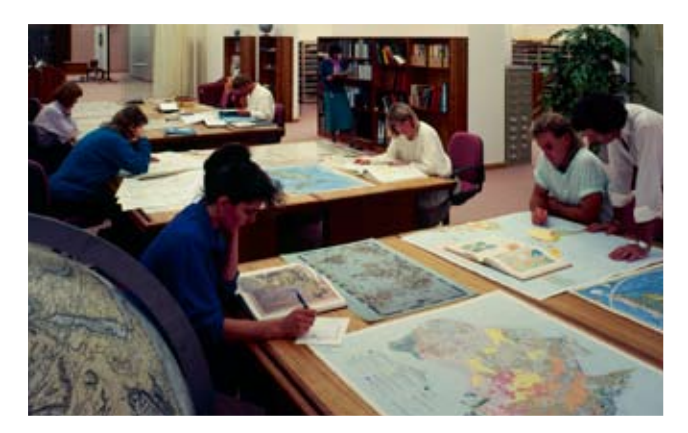
The Map Reading Room in the National Library of Australia

In 2007 and 2008, more than 500,000 people came through the National Library's doors and millions more visited the Library online.