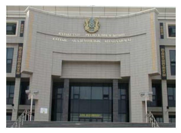
The National Academic Library of the Republic of Kazakhstan, Astana city

To involve readers in studying languages, we found an interesting activity called the "Day of First-Year Student". We organised it in our reading