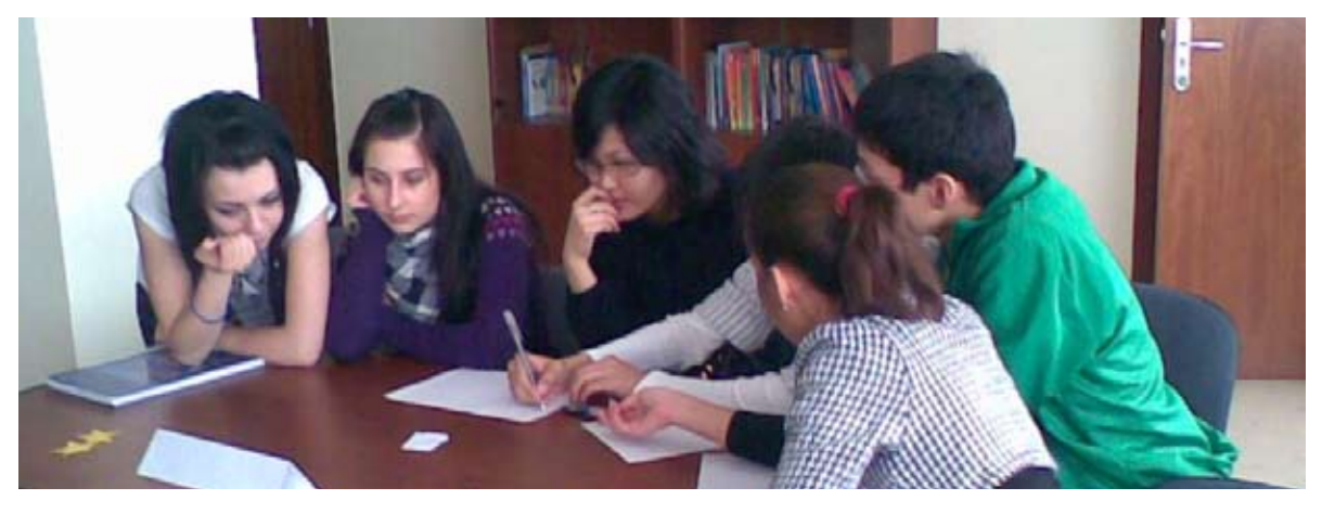
First-Year students of Eurasian Humanities Institute solving a puzzle

To organise and conduct the "Day of First-Year Student" activity, librarians need to prepare puzzles, quizzes and riddles. Students are divided into several teams and they select their own team names. There is also a panel of judges, comprising librarians and teachers, to decide which is the best team. The most active participants are rewarded with books.