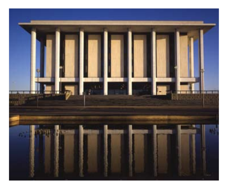
The iconic National Library of Australia in Canberra

The Treasures Gallery will also feature the best of the National