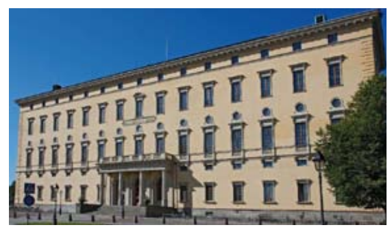
The ALP Secretariat is hosted by Uppsala University Library in Sweden

The Action for development through Libraries Programme (ALP) has been formulated by IFLA's members in Africa, Asia and Oceania, and Latin America and the Caribbean to address important issues and meet important needs in developing countries.