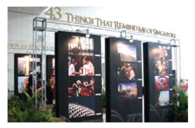
Singaporeans tell their stories through a photo showcase depicting the sights and sounds of Singapore

The National Library also launched two online initiatives, namely the Virtual Donors Gallery and Flickr SNAP. The Virtual Donors Gallery (www.donors.nl.sg) is an online portal showcasing the highlights of the Donors Collection and local artefacts donated by the public during the first Heritage Road Show in 2006. Researchers and overseas visitors can now get a chance to see our local heritage in the comfort of their homes.