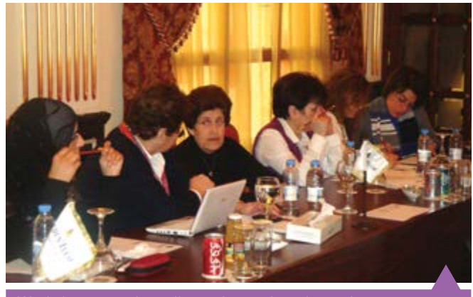
Workshop attendees discussing action plan to be implemented by LLA

The Lebanese Library Association (LLA) was proud to be the first to be chosen as participants by the Asia and Oceania region as the candidates of the IFLA project on Building Strong Library Associations Programme.