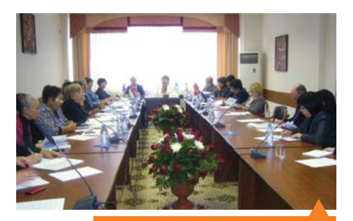
General view of the meeting