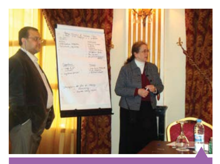
Workshop attendees sharing the resolve of SWOT analysis

The fourth workshop focused on how LLA could remain relevant in order to thrive and survive. The way forward is to build and maintain a solid membership base and establish good relations with its community partners. The Association will also need to continue to explore and undertake more attractive and interesting projects to sustain its momentum.