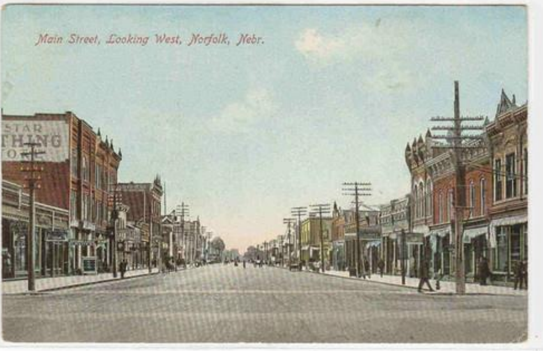
Main Street, Looking West, Norfolk, Nebr.

Many other resources such as post cards.