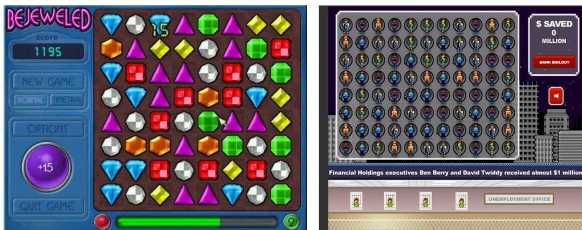
Illustration 2: Editorial newsgames – Bejeweled as 'blue-print' for Layouff!

If the newsgame is to be used as an equivalent to a column or a letter from the editor, journalists/designers most often opt for short 'bite-sized' formats, conveying small bits of information and opinion. These graphically rather simple editorial games (e.g. September 12 th ; Kabul Kaboom! ; Layouff! ; Shame Gas ) rely on easy-to-grasp game mechanics that one intuitively understands or that almost everybody is familiar with. Thus, they most often borrow from simple arcade, console or casual games such as PacMan , Kaboom! , Tetris or Bejeweled . This makes them appealing, easily playable and understandable for people who do not play regularly – and those who are more familiar with the matter probably get the reference with a wink of the eye.