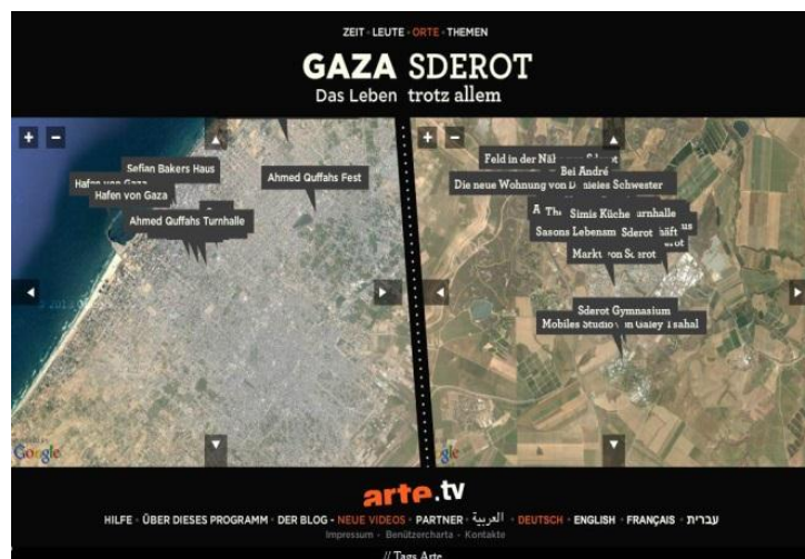
Illustration 5: Docugames – Gaza/Sderot

The latter gives an impressive and highly emotional insight into the day-to-day experiences of men, women and children on both sides of the Palestinian-Israeli border – in Gaza (Palestine) and Sderot (Israel). Over the course of two months, two two-minute films were being placed on the site each day – one from Israel, one from Palestine. The whole corpus of video-accounts could then be accessed either chronologically or by character – i.e. by 'accompanying' one protagonist from day to day, or by place – following the events that occurred in one certain location.