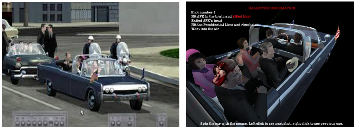
Illustration 4: Docugames – JFK Reloaded

Thus, they are prone to present complex topics 'customized' by special interests as well as individual attention 'types' of users: 'visual types' who prefer reading texts or watching films, 'audial types' who favour the spoken word, or 'kinesthetic types' who like experiencing issues by using their (physical) skills.