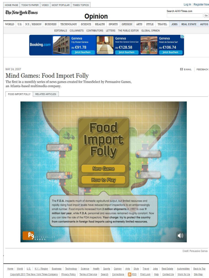
Illustration 3: Reportage games – New York Times' Food Import Folly

If the newsgames take the function of a reportage or a feature, media companies most often call them reportage games . These carefully researched programs are more complex than editorial games and emulate factual reporting . However, in contrast to documentary games (which we address later), they are less encyclopedic and do not allow for multi-online playing (implying participation) or even creative user-content contribution. The reason for this is that – as a sub-genre of current event games – they have to be quickly produced and released because the issues they address must still be topical.