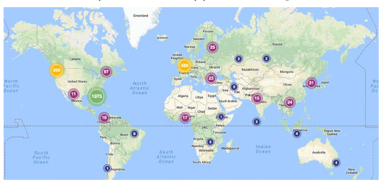
Readership Distribution: TWC Newspaper collection in the Digital Archive