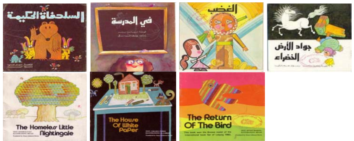
Books by Dar Al Fata Al Arabi

The specialized publishing house Dar Al Fata Al Arabi, the first of its kind, stood out in the publishing landscape of the time. Since its founding in 1970, it imposed criteria to ensure quality, and put forward authors and painters committed to improving the children's book in both content and form, but above all to revolutionizing the role and the message of the children's book.