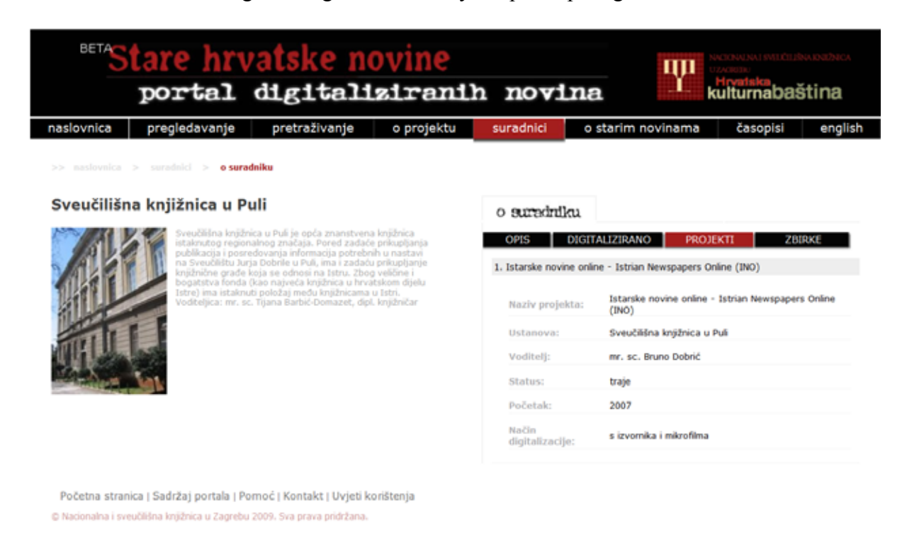
Fig.3: Basic information about participating institutions

module. The licences for the use of this module are adapted to different levels of authorisation that each institution has. The Portal functions as the content repository as well, since it can also store digital images delivered by the participating institutions.