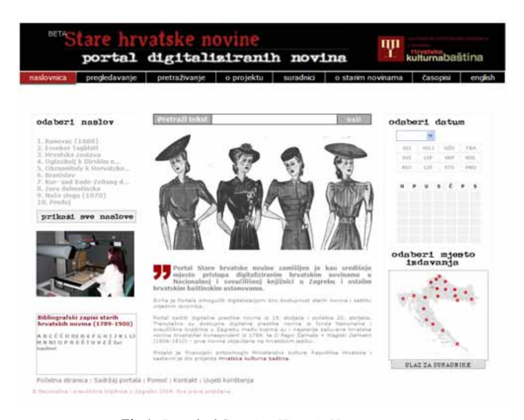
Fig.1: Portal of Croatian Historic Newspapers

To protect valuable originals of the oldest Croatian newspapers and journals from its collection and to enable open access to users, the National and University Library in Zagreb (later in this text called 'the Library'), that is in possession of the most complete fully catalogued collection of Croatian newspapers published in the 19<sup>th</sup> century<sup>2</sup>, started digitising these already in 2001, in line with its mission 'to collect, catalogue, store, protect and ensure access to its collection'.<sup>3</sup> Other Croatian libraries and heritage institutions started digitising their collections as well, but results of these individual digitisation projects were not always publicly available or searchable. Furthermore, there is no union catalogue of serials in Croatia that would contain basic metadata and information on holdings, or on their completeness and condition, and thus serve as a basis for selection of titles to be digitised and an overall coordination of digitisation of newspapers and journals.