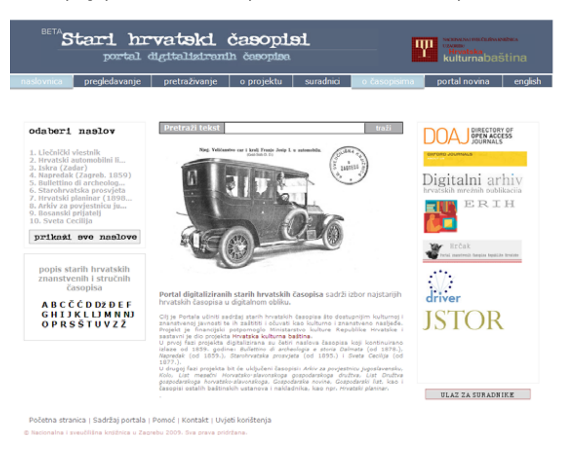
Fig. 2: Portal of Croatian Historic Journals

The creation of the Portal of the 19<sup>th</sup> century Croatian Historic Newspapers and Journals (later in this text called 'the Portal') is the outcome of the analysis of this situation. Further impetus was gained from the Conclusions of the Round Table: The State of Newspaper Collections in Croatian Libraries at the 35<sup>th</sup> Assembly of the Croatian Library Association (Plitvice, September 2006) that pointed out the urgent need for the protection of the 19<sup>th</sup> century newspapers.<sup>4</sup> The basic goals of the Portal creation were to devise an integrated solution for the prevention of further deterioration of cultural heritage and to enable long-term preservation and open access to valuable old collections in the Library and other heritage institutions by means of a cooperative system for data input and management. The name: the Portal of the 19<sup>th</sup> Century Croatian Historic Newspapers and Journals stands both for the underlying system and the outer layer, the visible interface of the system.