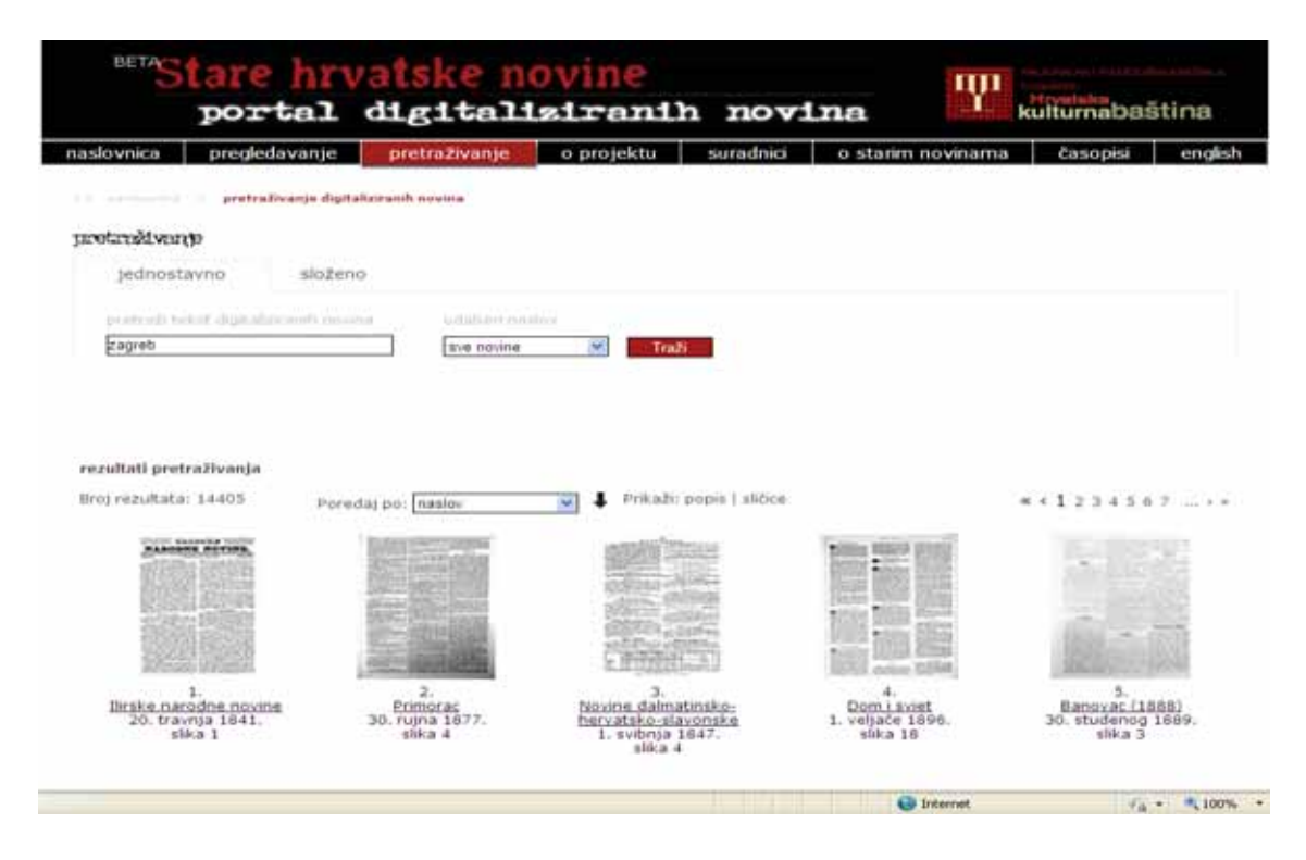
Fig.5: Search page of the Portal