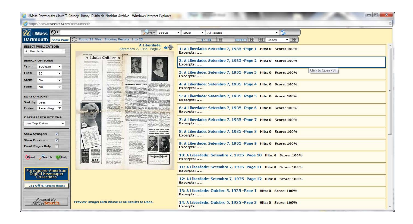
Figure 5: Screen capture of the search results screen