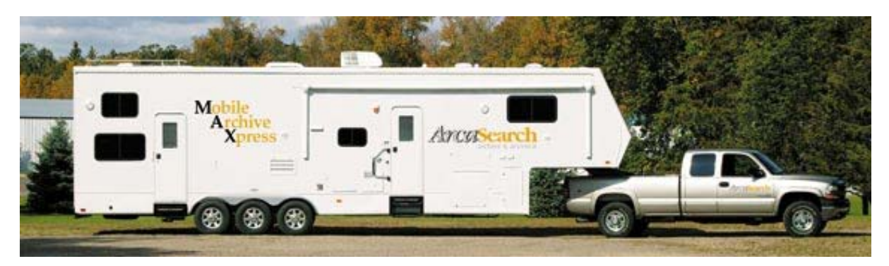
Figure 1: The ArcaSearch mobile laboratory 'MAX': a converted RV

Due to the fragility of the papers, the Freitas Library required the digitization to be done on site, a logistic barrier, which was solved by having Color Max carry out the digitization on the premises of the PFSA, utilizing ArcaSearch's mobile digital laboratory.