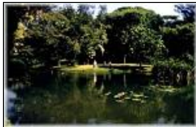
Durban's Botanical Gardens