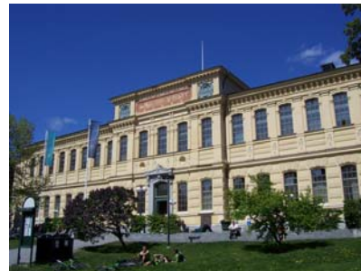
Kungliga Bibloteket – National Library of Sweden