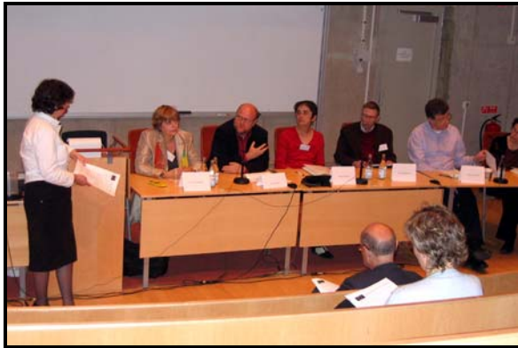
Panel discussion at the Think Tank