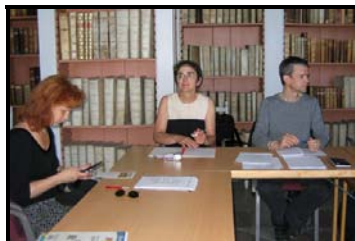
The committee at work in the University Library