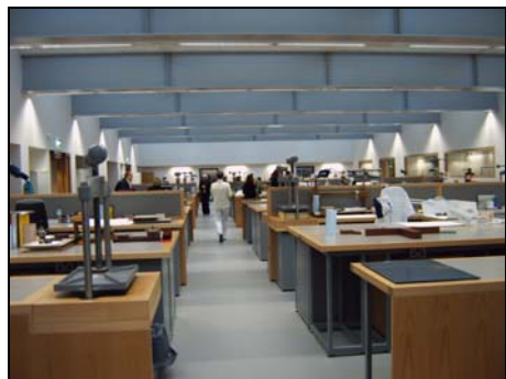
One of the new conservation studios

Running alongside is a dedicated wet area for washing and other aqueous treatments of collection items. There is a fourth studio, which in addition to being an administrative base for a team, is flexible enough to accommodate project work, workshops and demonstrations and training programmes. There are a number of other facilities in the building such as areas for the treatment of material with solvents, a separate space for leafcasting, a workshop and a facility for archival box-making.