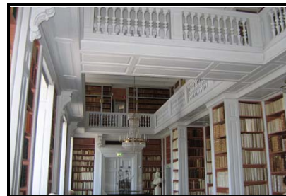
The beautiful Book Hall Uppsala University Library